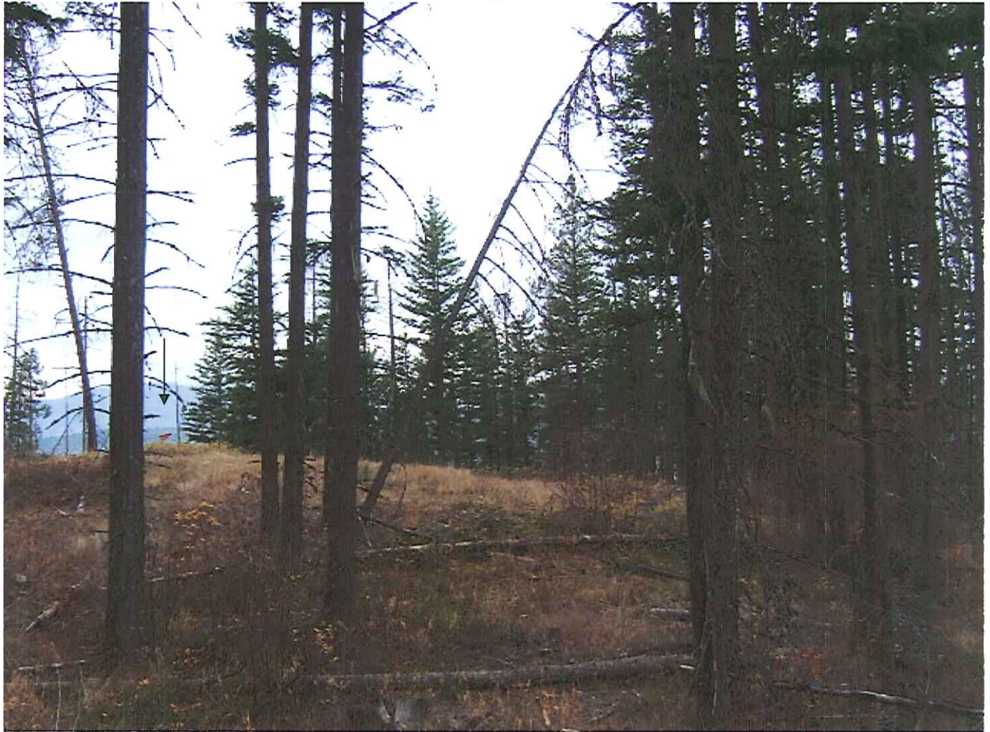
Clearing at top of hill for communications site area (25m x 50m)