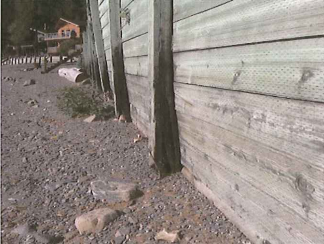
Existing post shear failure at toe