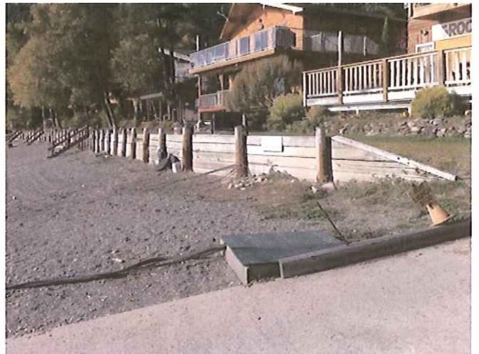
Totem South wall