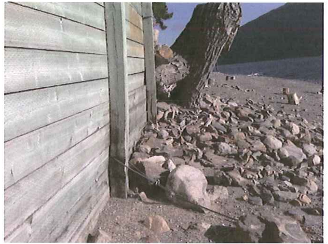
Existing cable anchor