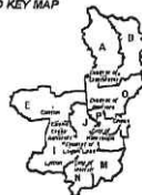
TNRD KEY MAP