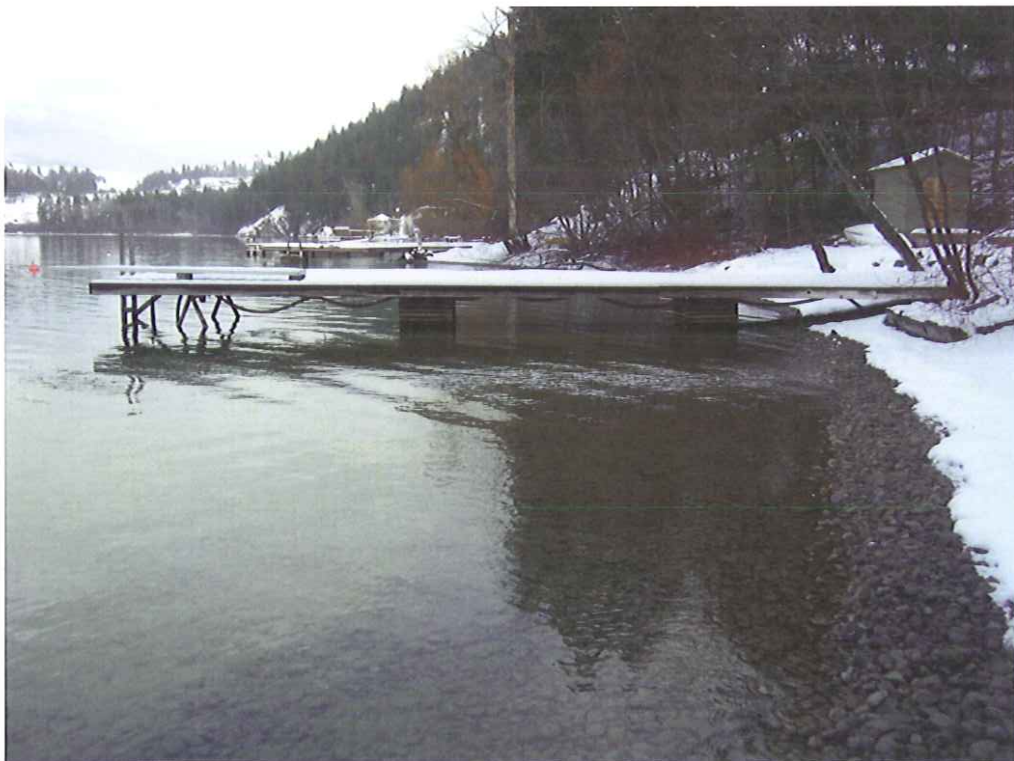
Foreshore of subject property looking East