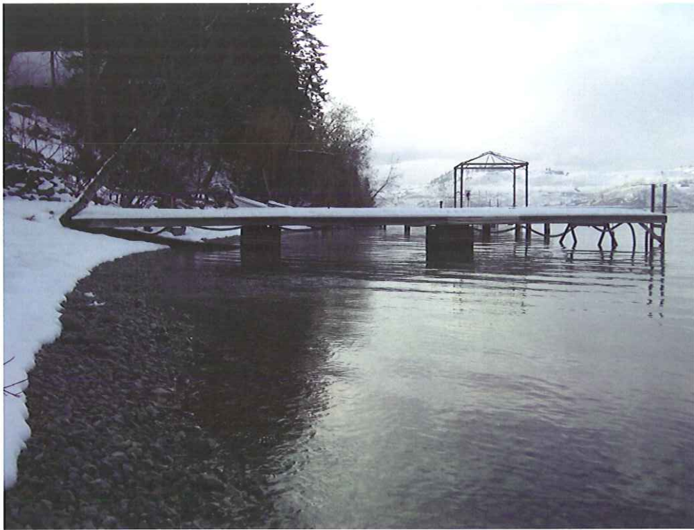
Foreshore of subject property looking West