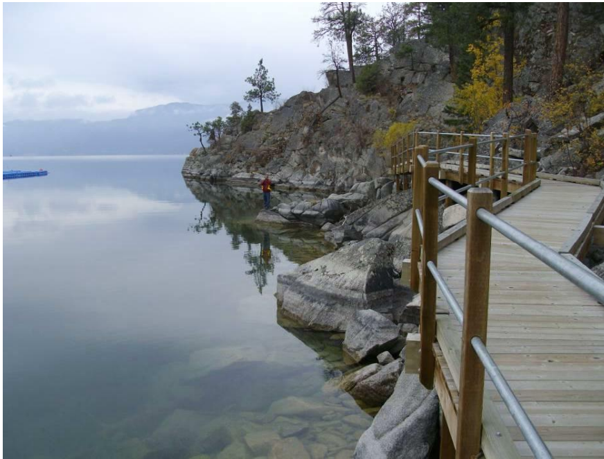
Existing boardwalk and bedrock spit of land. The proposed boardwalk extension and ramp will be constructed near the rock where the surveyor is standing. (Summit: Oct. 2010)