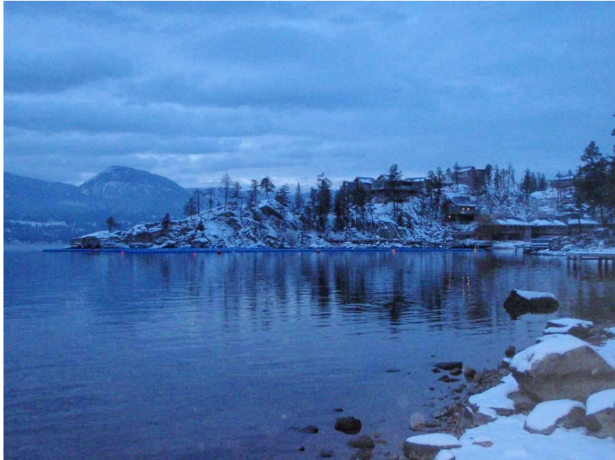
View looking northwest into South Bay where the proposed marina will be constructed. Note the Wave-Break structure being stored for the winter and note the neighboring dock. (Summit: Dec 21, 2010)