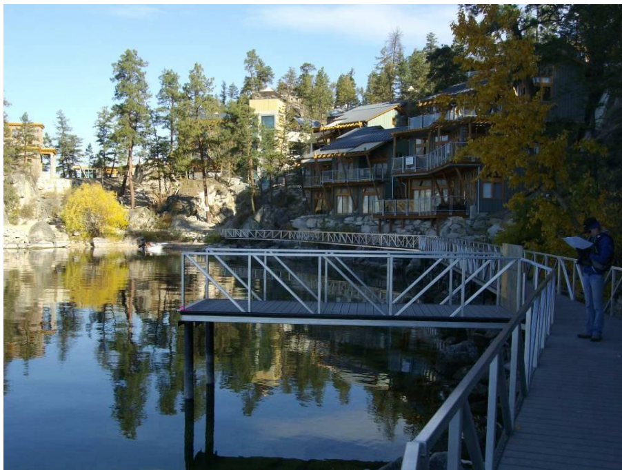
Existing boardwalk and ramp access for the Quarry Bay Marina (will remain in place for boater loading and unloading). (Summit: October 2008)