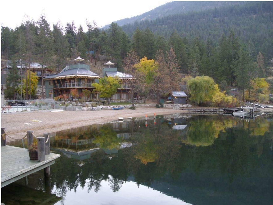
Outback Resort South Bay beach and boardwalk. (Summit: Oct. 2008)