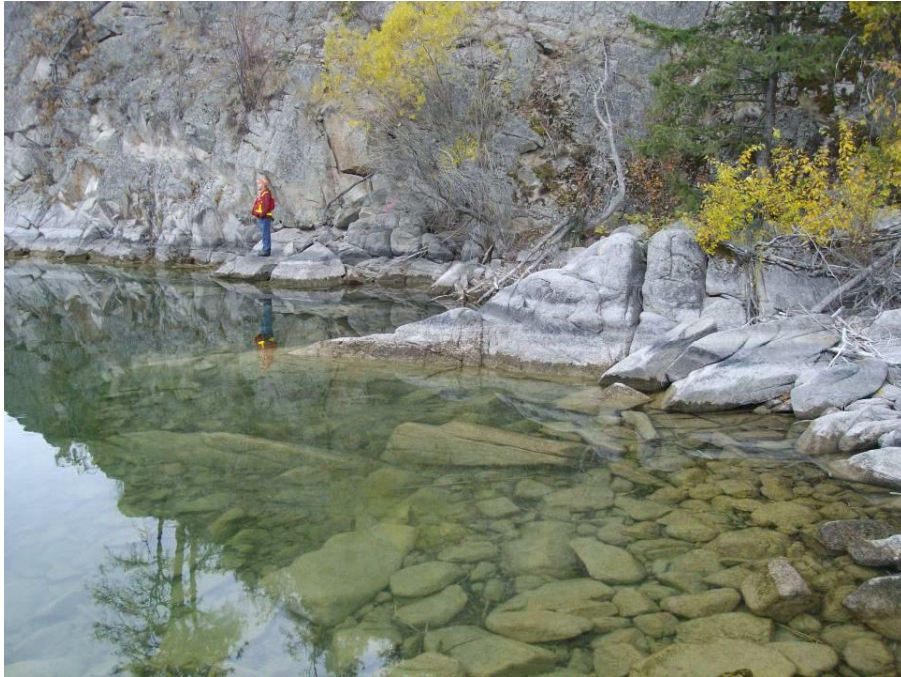
Rock face spit of land along which the proposed marina will be constructed. (Summit: Oct 2008)