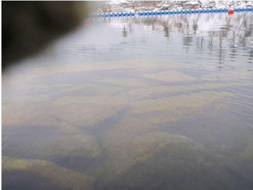
Rock outcrop in South Bay where the eastern breakwater is proposed. (Summit: Dec 21, 2010)