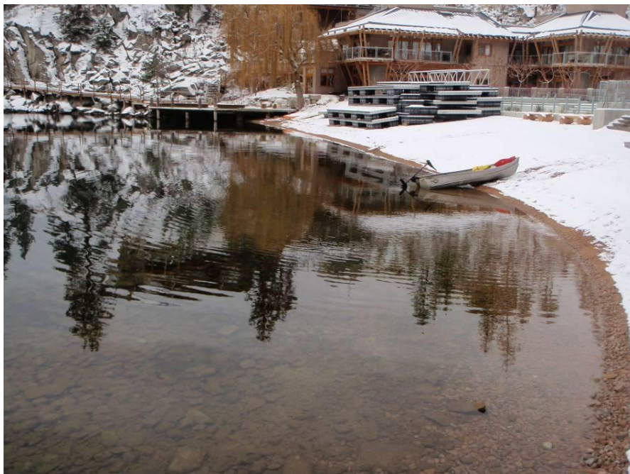
Beach and existing boardwalk in South Bay. Note the marina components in storage. (Summit: Dec. 21, 2010)