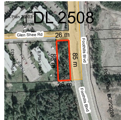
Scale - 1:5,000