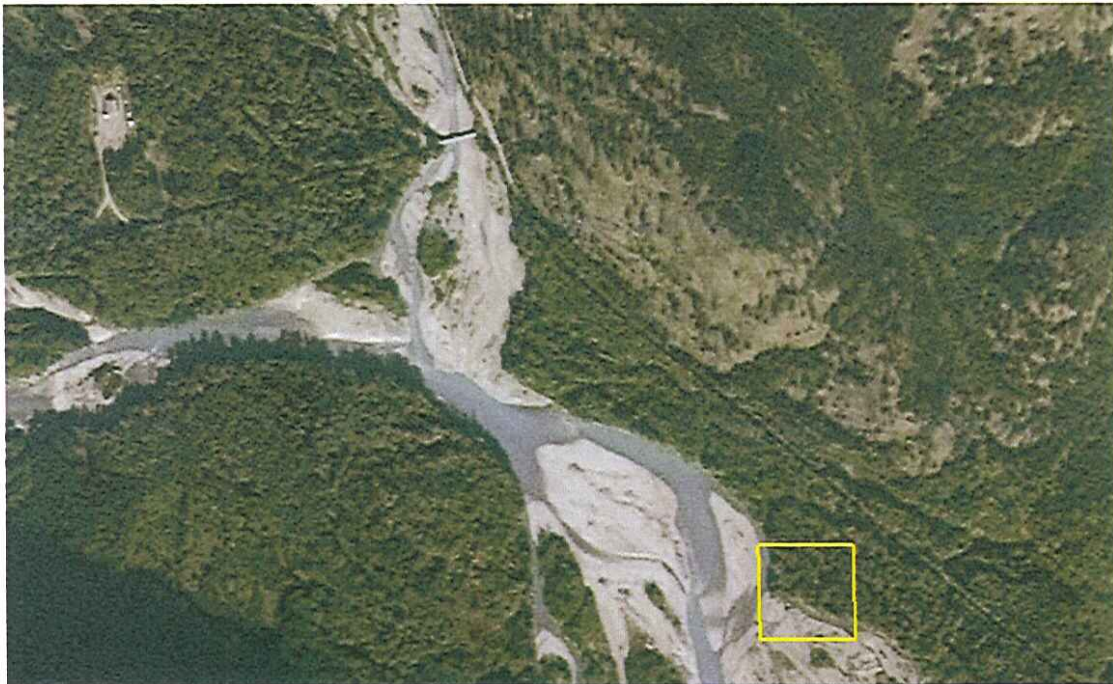
3 hectare area that encompasses 2 camp location options