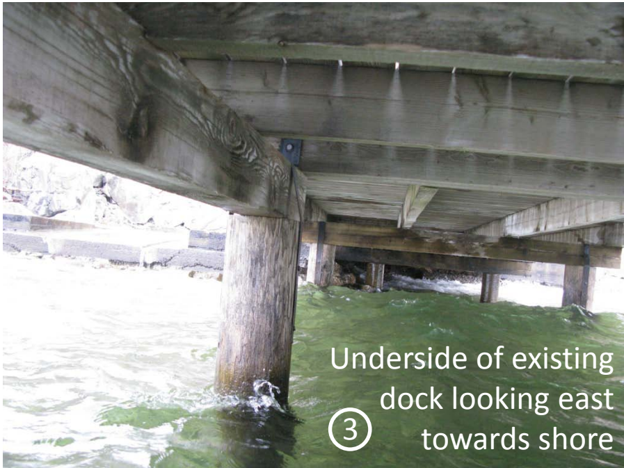
Underside of existing dock looking east towards shore ③