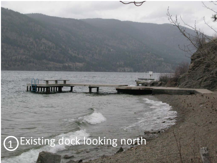
① Existing dock looking north