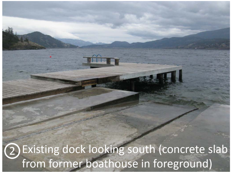
② Existing dock looking south (concrete slab from former boathouse in foreground)