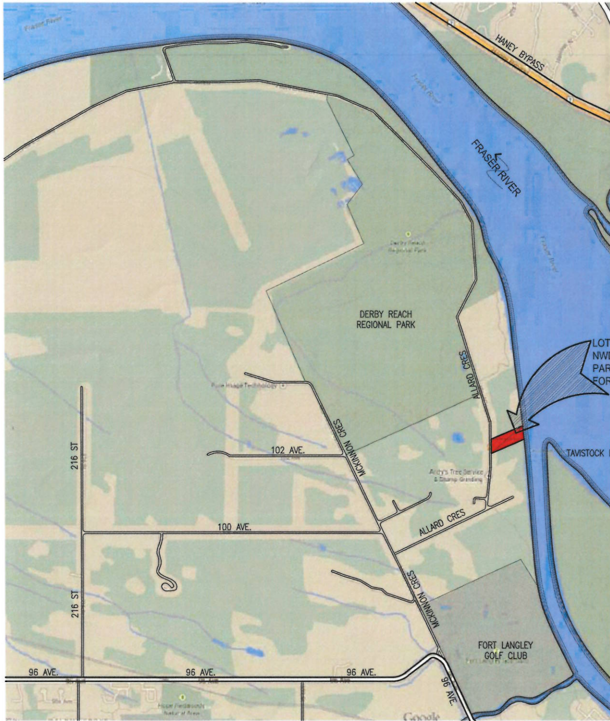
A GENERAL SITE PLAN "A" SCALE: 1:20000 MTS