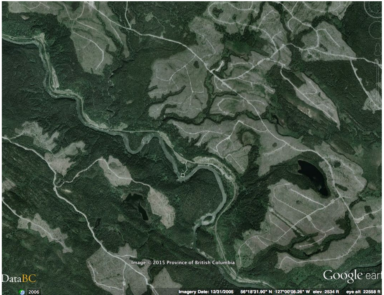
Map Overview, Google earth, 22,500 feet