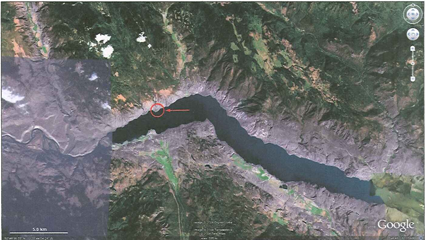
Figure 1. Overview of region. Property location indicated by red circle, on the north bank of Kamloops Lake, approximately 5.5 km upstream (east) of the TransCanada Hwy bridge crossing the Thompson River. Scale: 1:205,000